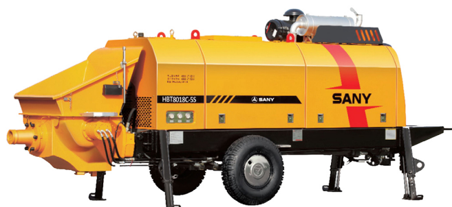
STATIONARY CONCRETE PUMP