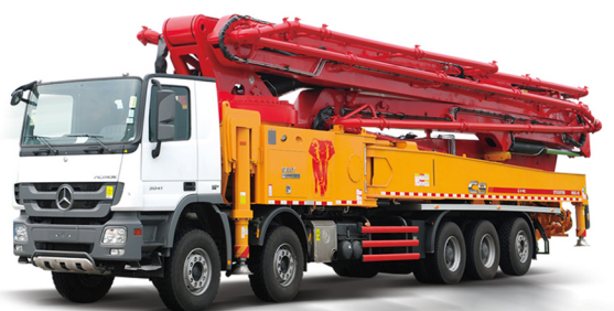
TRUCK MOUNTED CONCRETE PUMP

Thus, come and learn more about our service and you will pick us without hesitation!